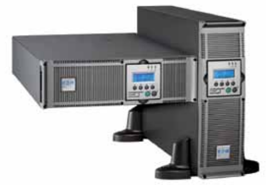
Eaton MX versatility