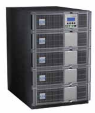
Eaton MX Frame